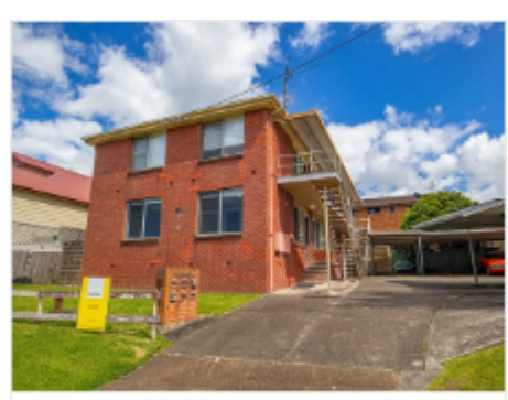
3/2C Morgan Street, Adamstown, NSW 2289