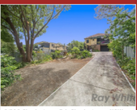
2/216 Charlestown Rd, Charlestown, NSW 2290

Ideally located between Charlestown Square and John Hunter Hospital, with public transport & Inner city by-