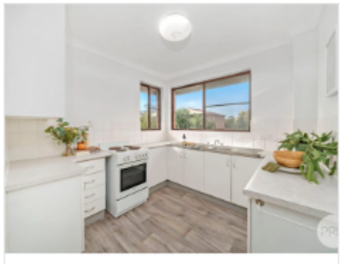
17/1 Weatherly Close, Nelson Bay, NSW 2315

The perfect location between some of the beach beaches Port Stephens has to offer! A short stroll to Shoal Ray Reach or Little Reach, and to Weste Ding.