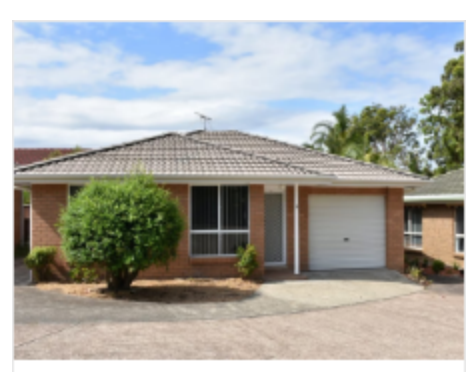
9/24 Bowman Drive, Raymond Terrace, NSW

Located in a quiet complex, this two bedroom unit is set back from the street offers convenience and easy