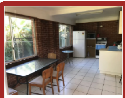
Address available on request, Shortland