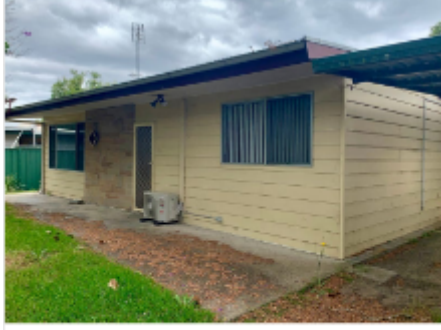
48B Avondale Road, Cooranbong, NSW 2265