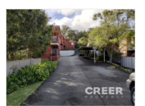
4/41A Edward Street, Charlestown, NSW

Cute one bedroom unit in a convenient location in Charlestown-Large sized bedroom with built in wardrobe Nice and confortable living internal layer.