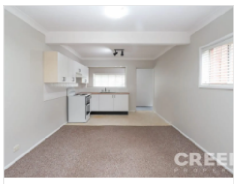
157A Bay Road, Bolton Point, NSW 2283