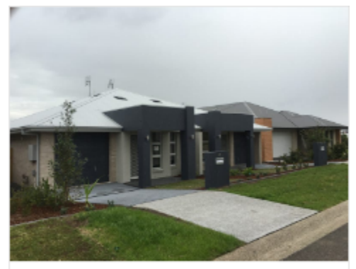
28 Yellena Road, Fletcher, NSW 2287