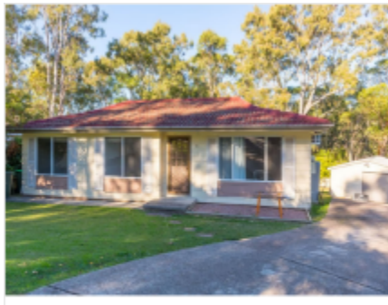
9 Wybalena Close, Kilaben Bay, NSW 2283 VIEWING A PROPERTY & APPLYING FOR TENANCYTO assist you with understanding the inspection and application process, please refer to the information...

9 Wybalena Close, Kilaben Bay, NSW 2283 3 Bedrooms-- 1 Bathroom-- 2 Garage House $420 - $450 Per Week Bond $1,680 Available now