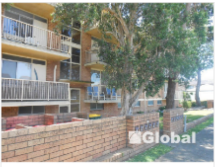
11/172 Brunker Road, Adamstown, NSW

Conveniently located to Adamstown shops and public transport.Features:- 2 bedrooms (1 x built in and