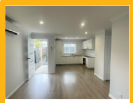
10a Kapala Avenue, Summerland Point, NSW 2259

This beautiful home has much to offer & comes with all the quality finishes that makes day-to-day living