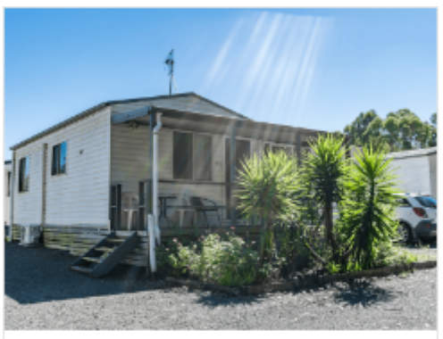
4406 Pacific Highway, Twelve Mile Creek, NSW 2324

We currently have various cabin options available in Twelve Mile Creek with the following features.- One bedroom cabins. Two bedrooms cabins. Each cabin.