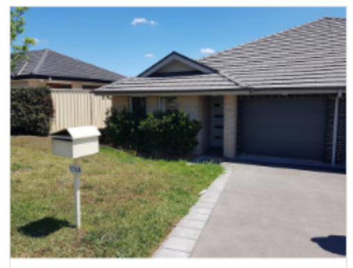
128a Aberglasslyn Road, Aberglasslyn, NSW

3 Bedrooms with built-ins- Master has ensuite and walk-in robe- Single car garage- Fully Fenced yard- 2