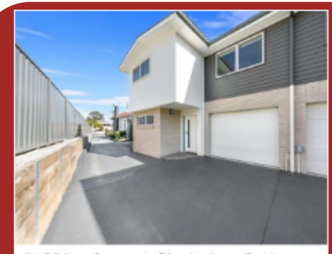
4 / 10 Lee Crescent, Birmingham Gardens, NSW 2287

ROOM 1 available - $350 per week furnished with private ensuite, split system air con and garag