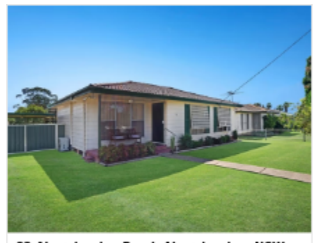
82 Aberglassiyn Road, Aberglassiyn, NSW 2320

2 Bedroom 1 Bathroom 1 Garage Duplex/Semi-detached $400 Per Week Bond $1,600 Available 21 Dec 2022 Cree property 02 4904 8400