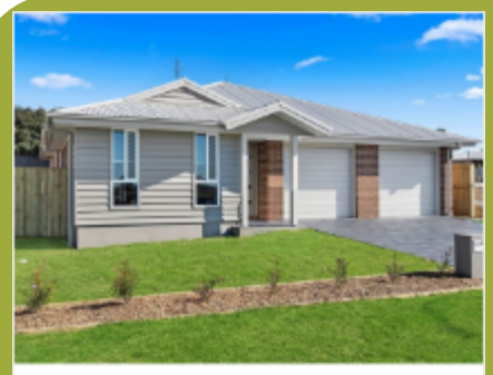
29 Friarbird Ridge, Aberglasslyn, NSW 2320