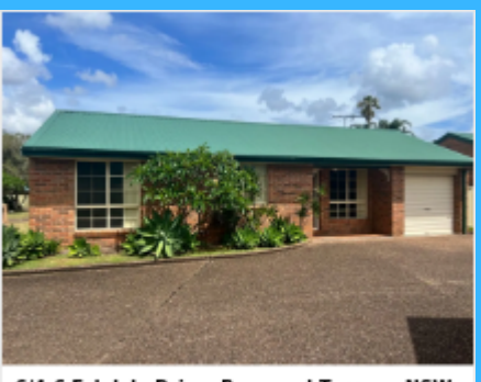
6/4-6 Eskdale Drive, Raymond Terrace, NSW 2324

17/1 Weatherly Close, Nelson Bay, NSW 2315 2 Bedroom 1 Bathroom 1 Garage Apartment $450 per week Bond $1,800 Open today 4:30pm View all Available 20 Dec 2022 PRD 02 4984 2000