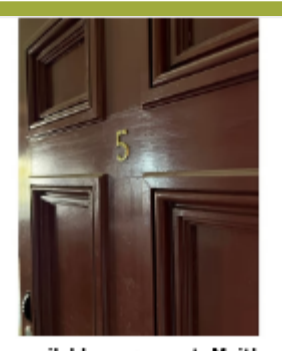
Address available on request, Maitland Room 5 available! $220 pw.PROPERTY FEATURES:-