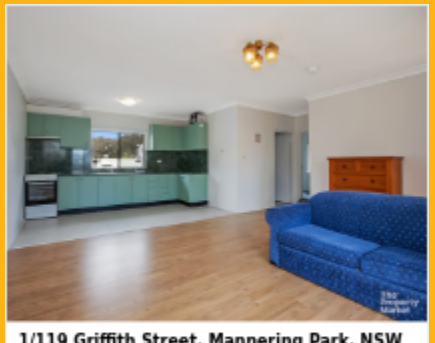
1/119 Griffith Street, Mannering Park, NSW 2250

Stunning lakeside location - waterfront reserve Large 2 bedroom unit Built-in wardrobes Open plan