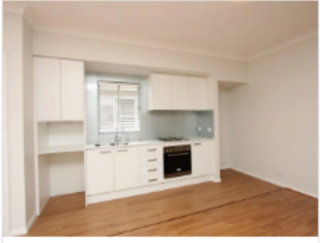
27B Rockleigh Street, Thornton, NSW 2322