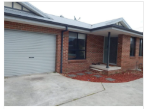
1/9A Irrawang Street, Raymond Terrace, NSW 2324

Located a short distance to the centre of town, this modern unit is the perfect home. Tucked away off the