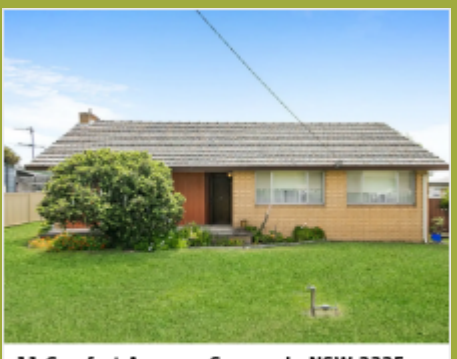
11 Comfort Avenue, Cessnock, NSW 2325

Applications are accepted through Realestate.com.au - please click on the apply button.