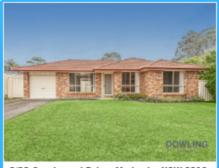
2/33 Coachwood Drive, Medowie, NSW 2318