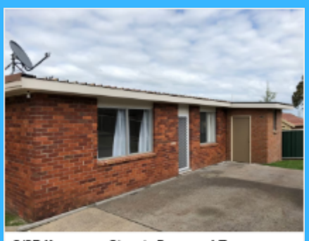
3/37 Kangaroo Street, Raymond Terrace, NSW 2324