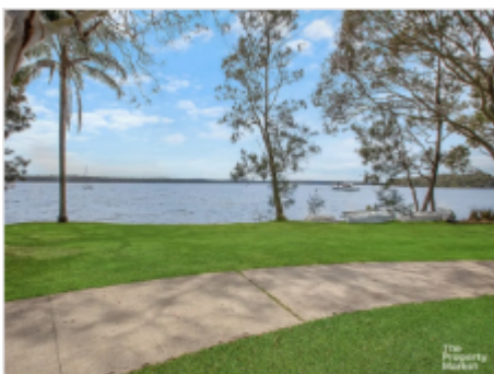
1/119 Griffith Street, Mannering Park, NSW 2259

Avery Property Professionals Rental Department - 02 4959 1677