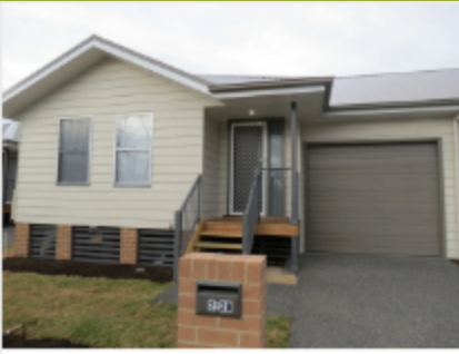
2/2B Henderson Avenue, Cessnock, NSW 2325