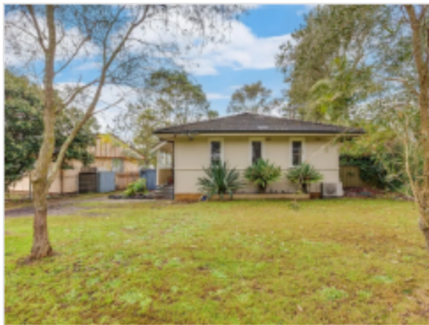
10 Roslyn Street, Raymond Terrace, NSW 2324

We are proud to present this updated 4 bedroom