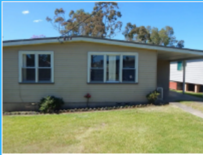
14 Franklin Street, Karuah, NSW 2324