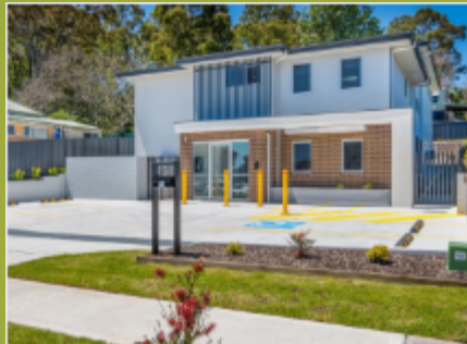
16 Cumberland Street, Cessnock, NSW 2325