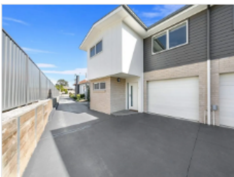
4 / 10 Lee Crescent, Birmingham Gardens, NSW 2287

ROOM 1 available - $350 per week furnished with private ensuite, split system air con and garage