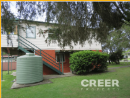
1/17 Higham Road, Hillsborough, NSW 2290