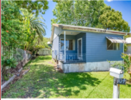
104 Watkins Road, Wangi Wangi, NSW 2267