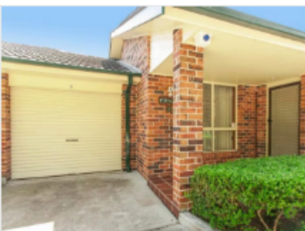
2/181 Adelaide Street, Raymond Terrace, NSW 2324

This well presented, easy maintenance unit is located in a quiet complex within walking distance to the centre of town. Features 2 bedrooms, both with built