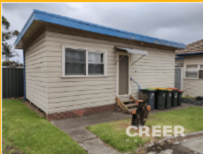
4/331 Maitland Road, Mayfield, NSW 2304