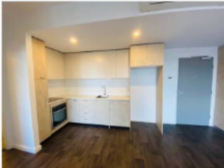
106/4 Merewether Street, Newcastle, NSW 2300

Located in Newcastle CBD and sitting approximately 150m from the waterfront providing an amazing location within close proximity to Restaurants Cafes