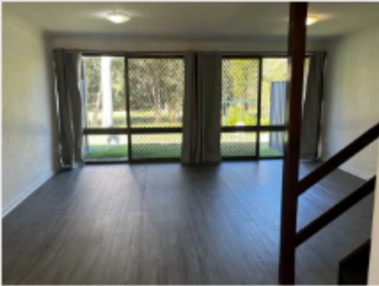
7/4 Mosman Place, Raymond Terrace, NSW 2324

2 bedroom 1 bathroom town house with a single carport allocated for your use. The property has been recently fully painted throughout with brand new