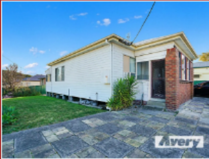
14 Anzac Parade, Teralba, NSW 2284