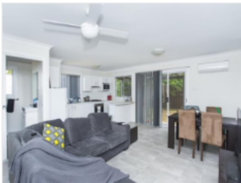
65A Love Street, Cessnock, NSW 2325