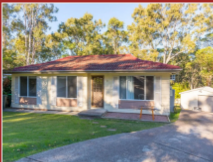
9 Wybalena Close, Kilaben Bay, NSW 2283