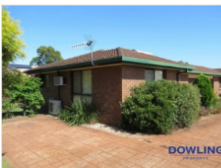
1/8 Auberge Close, Raymond Terrace, NSW 2324

Ideally located in a house proud cul-de-sac in close proximity to the Lakeside shopping complex and Tavern Eastureck 2 Bedrooms with built in to mainit