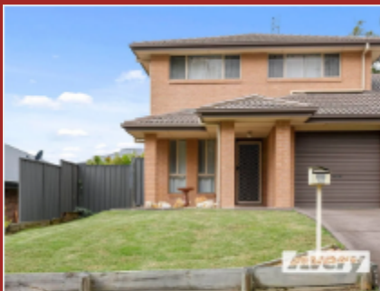
3A Lourie Close, Toronto, NSW 2283

Creer Property Tyler Fardell- 02 4904 8415