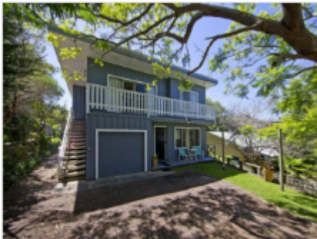
1/1 Christmas Bush Avenue, Nelson Bay, NSW 2315

Don't miss out on this two bedroom unit located close to Dutchies Beach & in one of Nelson Bay most sort after streets. It has ocean views, built in and off