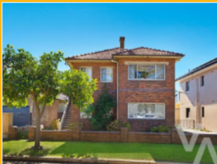
2/46 Hunter Street, Stockton, NSW 2295