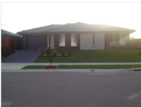
2 Bergman Way, Maitland, NSW 2320