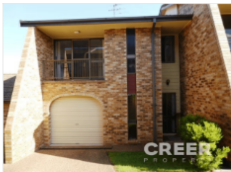
8/7 Hutton Street, Charlestown, NSW 2290

Avery Property Professionals Rental Department - 02 4959 1677