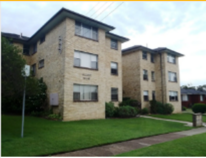
12/2 Noela Ave, New Lambton, NSW 2305