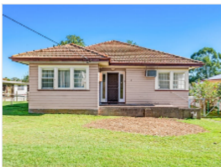
6 Vindin Street, Rutherford, NSW 2320