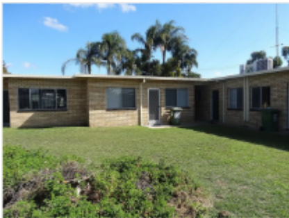
2/2 Edith Street, Cessnock, NSW 2325