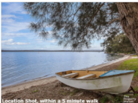
Location Shot, within a 5 minute walk