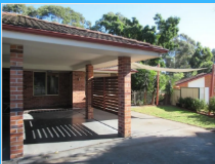
2/7 Gale Court, Raymond Terrace, NSW 2324