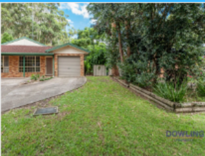
2/10 Coolabah Road, Medowie, NSW 2318