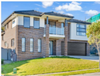
54 Breakwell Road, Cameron Park, NSW 2285

Available is this fully furnished contemporary shared accommodation providing quality living. Catering to local and international tenants some are available