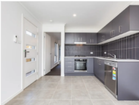
123a Norfolk Street, Fern Bay, NSW 2295