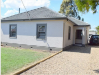
86 New England Highway, Maitland, NSW 2320