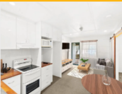
6/285 Watkins Road, Wangi Wangi, NSW 2267