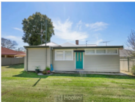
4/243 Maitland Road, Cessnock, NSW 2325