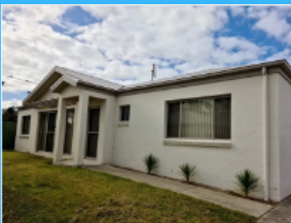
2/358 Tarean Road, Karuah, NSW 2324