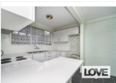
23/29 Taurus Street, Elmore Vale, NSW 2287

If you're looking for a relaxing place to come home to this low-maintenance brick and tile townhouse is perfect for you. Featuring 3 bedrooms 2 with built-i