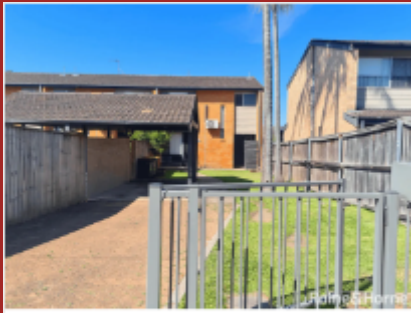
5 South Street, Windale, NSW 2306