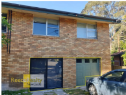
2C Hansen Place, Shortland, NSW 2307