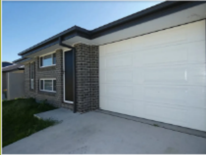
7 Longworth Lane, Thornton, NSW 2322