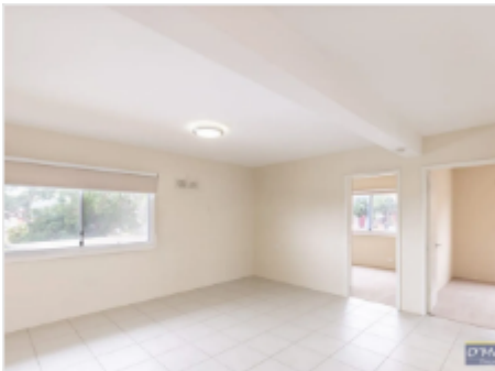
3/68 Government Road, Nelson Bay, NSW 2315