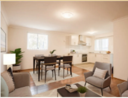
2/8 Mynah Close, Mount Hutton, NSW 2290