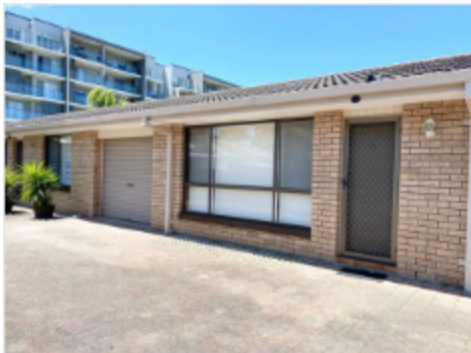
5/20 Messines Street, Shoal Bay, NSW 2315