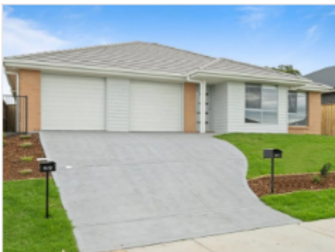
2/9 MCGLINCHEY CRESCENT, Thornton, NSW 2322

NEAR NEW Two Bedroom Duplex If you wish to pre-apply for this property, please visit our website at www.shortland.com.au and download an