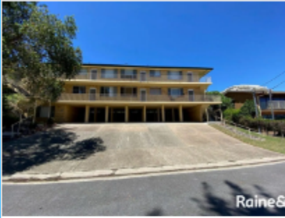
3/2 Lillian Street, Shoal Bay, NSW 2315