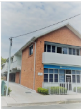
5/83 Church Street, Maitland, NSW 2320