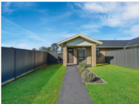
37 Auburn Street, Gillieston Heights, NSW 2321