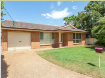
1a Foster Street, Cessnock, NSW 2325