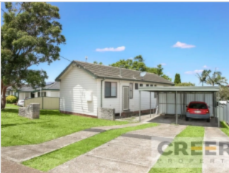
10 Croudace Road, Tingira Heights, NSW 2290

Altitude Property Management- 02 4903 8228