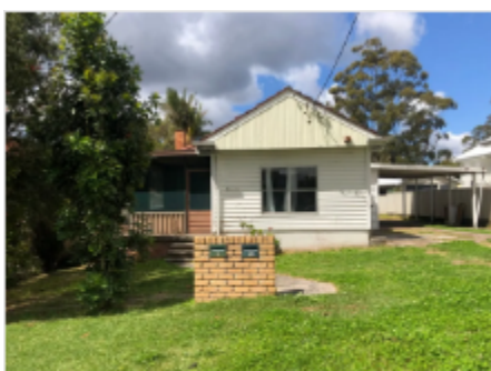
1/5 Irrawang Street, Raymond Terrace, NSW 2324