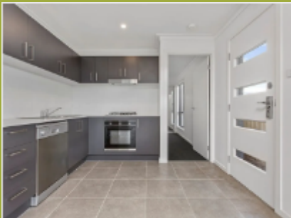
50a Plover Circuit, Aberglasslyn, NSW 2320