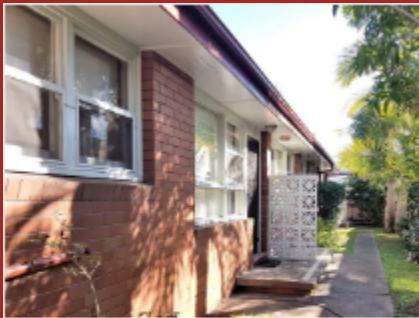
2/18 York Street, Mayfield, NSW 2304