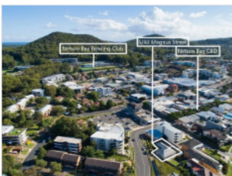
5/92 Magnus Street, Nelson Bay, NSW 2315