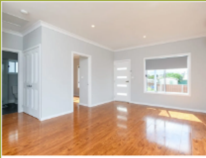
37 Maitland Lane, Cessnock, NSW 2325