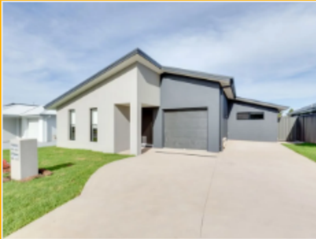
8a Santa Fe Close, Cameron Park, NSW 2285

Cul-de-sac location off Harris Street, Cameron Park.