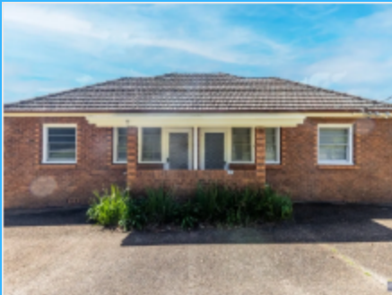
1/139 Horace Street, Shoal Bay, NSW 2315