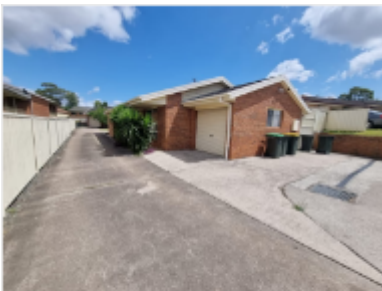
1/37 Ventura Close, Rutherford, NSW 2320