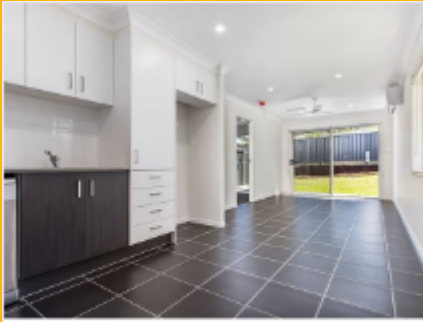
9A Potter Close, Fennell Bay, NSW 2283