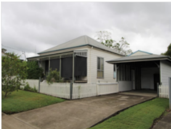
32a Harris Street, Cessnock, NSW 2325