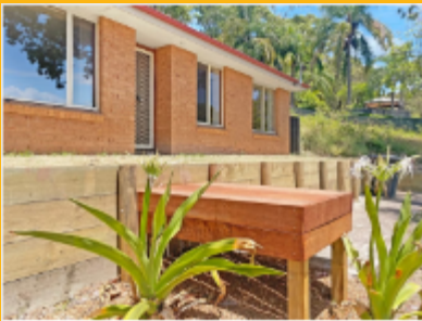
27 Nunda Road, Wangi Wangi, NSW 2267