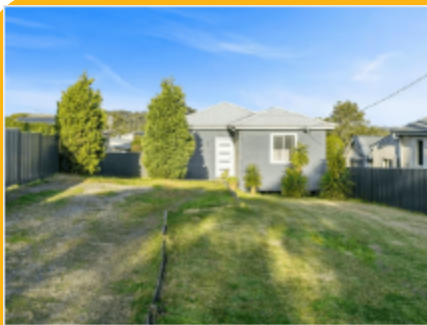
255 Lake Road, Glendale, NSW 2285