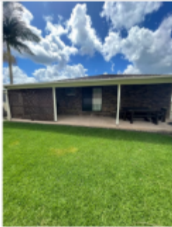
3a Harris Street, Cessnock, NSW 2325