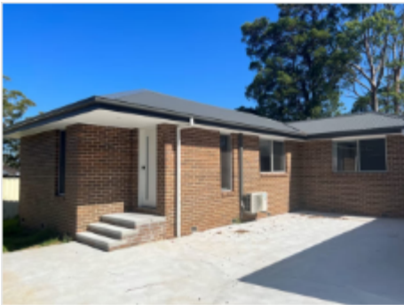
3/17 Coolabah Road, Medowie, NSW 2318

Brand new 2-bedroom unit at the back of the 3-unit complex.