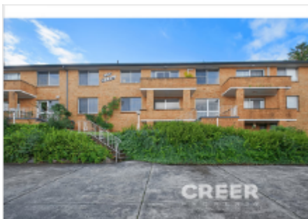
4/37 Edward Street, Charlestown, NSW 2290