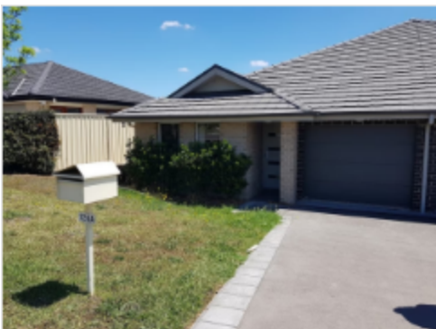
128a Aberglasslyn Road, Aberglasslyn, NSW 2320

3 Bedrooms with built-ins- Master has ensuite and walk-in robe- Single car garage- Fully Fenced yard- 2 Air Conditioners- 2 Living areas- Undercover