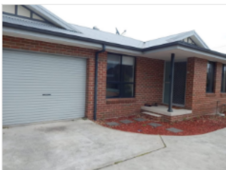
1/9A Irrawang Street, Raymond Terrace, NSW 2324

Located a short distance to the centre of town, this modern unit is the perfect home. Tucked away off the main road, this duplex has been freshly painted and