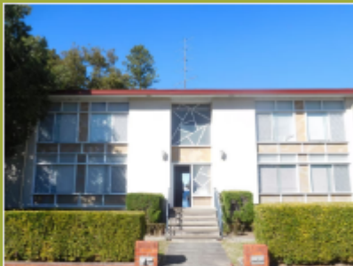
1/21 View Street, Cessnock, NSW 2325