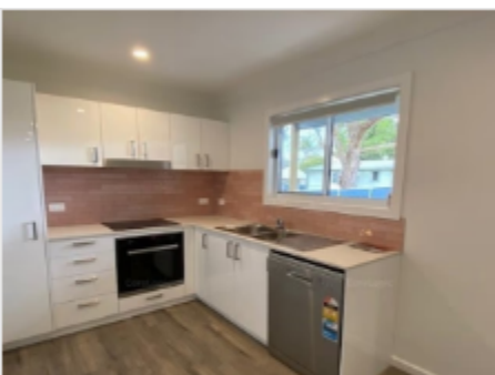
1A Dean Parade, Raymond Terrace, NSW 2324

Modern granny flat is located close to schools, shops and local transport. This property is set on the back of the main house and also features 3 Bed bedrooms