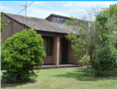
1/2 Hillside Drive Close, Raymond Terrace, NSW 2324

This tidy 2 bedroom unit featuring 2 generous bedrooms both with built-in robes. Bathroom with separate shower and bath. Open plan living and