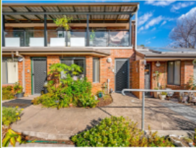
2/14 King Street, Cessnock, NSW 2325

This is a wonderful opportunity for a client service provider or individual to move into this beautiful purpose built seniors living home in Cessnock.