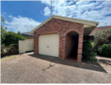
1/54 Benjamin Lee Drive, Raymond Terrace, NSW 2324

In a great location close to Lakeside shopping centre and transport, this two-bedroom brick duplex is ideal for someone who loves gardening or looking to