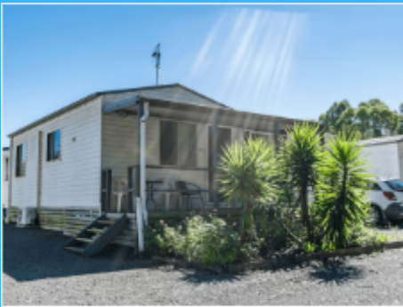
4406 Pacific Highway, Twelve Mile Creek, NSW 2324

We currently have various cabin options available in Twelve Mile Creek with the following features:- One bedroom cabin, Two bedrooms cabin, Each cabin