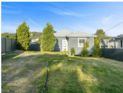
255 Lake Road, Glendale, NSW 2285