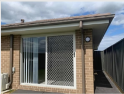
2/9 Garland Rd, Cessnock, NSW 2325