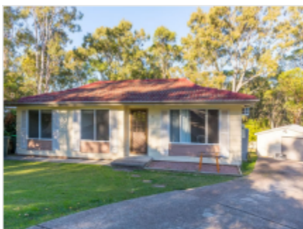
9 Wybalena Close, Kilaben Bay, NSW 2283